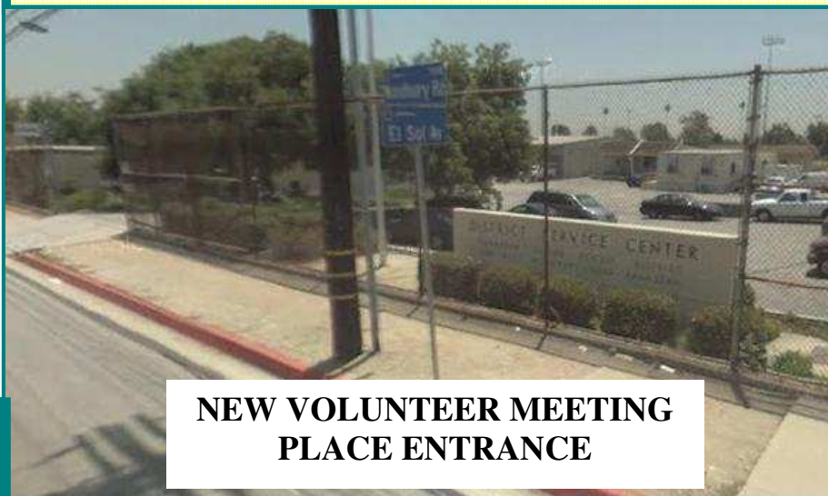
NEW VOLUNTEER MEETING PLACE ENTRANCE

740 W. Woodbury Rd. Pasadena. About a 1/4 mile west of Lincoln Ave. If you were to take the 210 freeway get off at the Arroyo/Windsor Aves. off ramp and head north to Woodbury Rd. turn right (east).