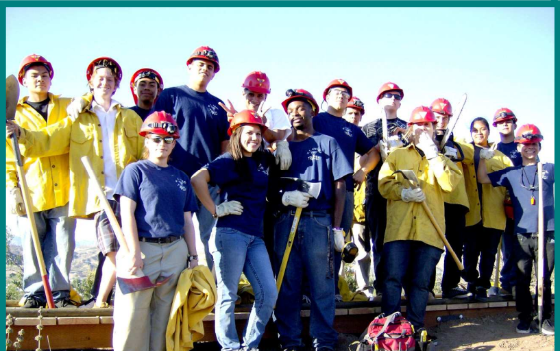
William S Hart UHSD crew ready for new year

• Jan 2 nd , Jan 9 th , Jan 16 th , Jan 23 rd , Jan 30 th Join us for a 30-minute nature walk at the Big Bear Discovery Center to learn about the local plant and wild life and some very interesting historical facts. Great activity for families and individuals who want to gain a greater appreciation for our National Forest. Nature walks are not strenuous and designed for all levels of physical conditioning. Meets at the Big Bear Discovery Center