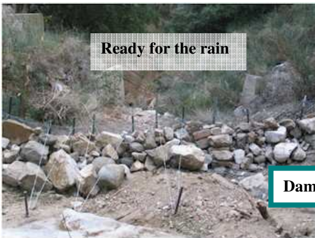
Dam is done!