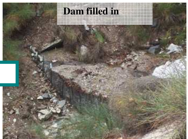
Dam filled in